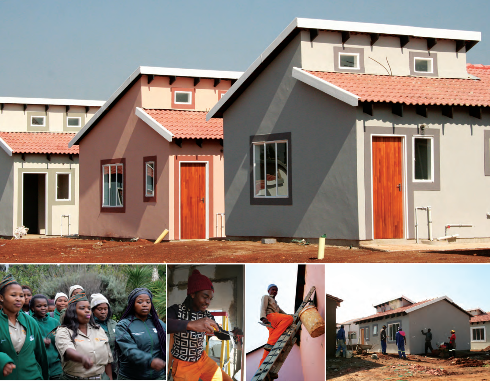
ASSURING QUALITY HOMES