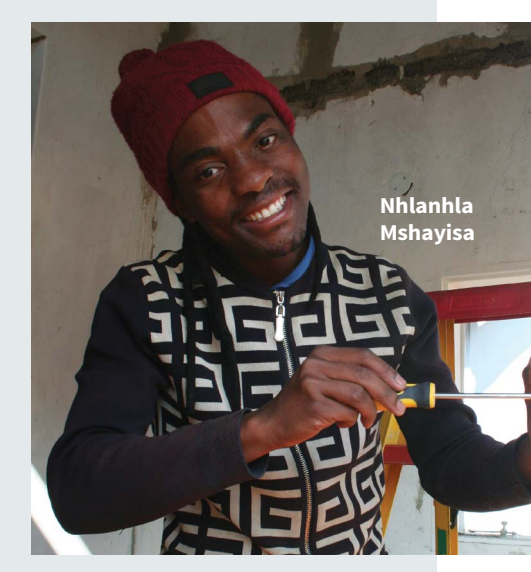
What are you grateful for: My family, without their support from lower to tertiary education, I wouldn't be where I am today

What do you dislike: Selfish people who hold back information. I believe we need to give and when you achieve something you need to help others